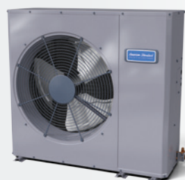
Silver 16 Low Profile