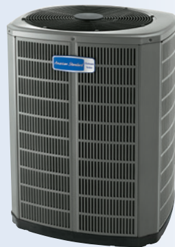
AccuComfort™ Platinum 20

American Standard Platinum air conditioners offer our highest combination of performance, efficiency, and temperature control. Built with American Standard's commitment to quality throughout, the Platinum line offers advanced energy-saving features like Duration™ variable speed compressors and Spine Fin™ coils.