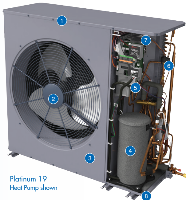
Platinum 19 Heat Pump shown

**Platinum 20/Platinum 18/Platinum 19 vary speed in 1/10 of 1% increments.